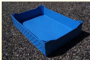
Solid tray with raised corners