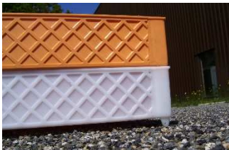
Solid trays without raised corners

Range of products with same dimensions :