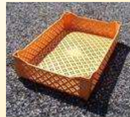
open-weave tray with raised corners